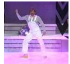
Video: ?uestlove & Jimmy Fallon on 106 & Park + Dance Avenue