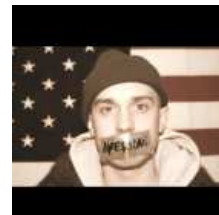
Video: Emilio Rojas "Right To Stay"