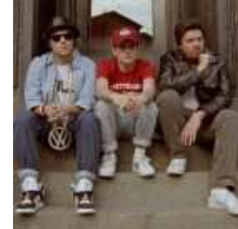
Video: Beastie Boys "Fight For Your Right" Revisited