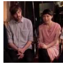
Video: Little Dragon "Little Man" Live In-Studio Performance