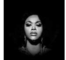
Video: Jill Scott "Shame" featuring Eve