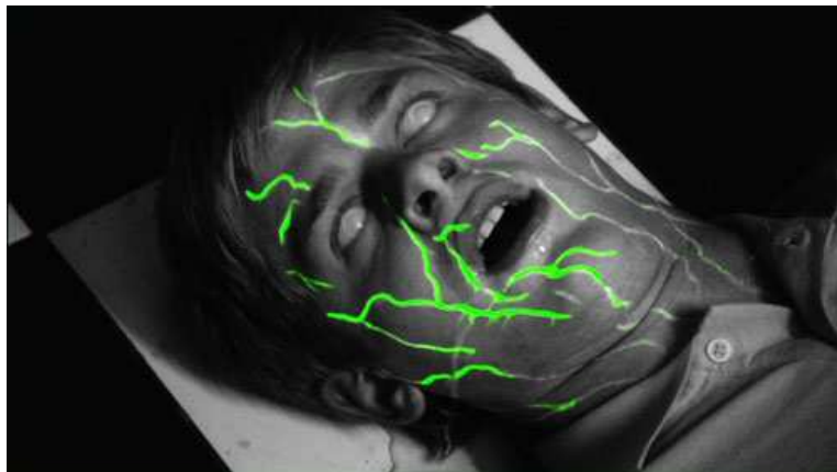
It's the newest craze from Japan: Zombukake!!

them. When they arise, they bumble around trying to find out what happened to them. With the help of a soldier from a nearby military base, they begin to unravel a mystery that will give them the answers they seek, and also help them understand that new craving for human brains.