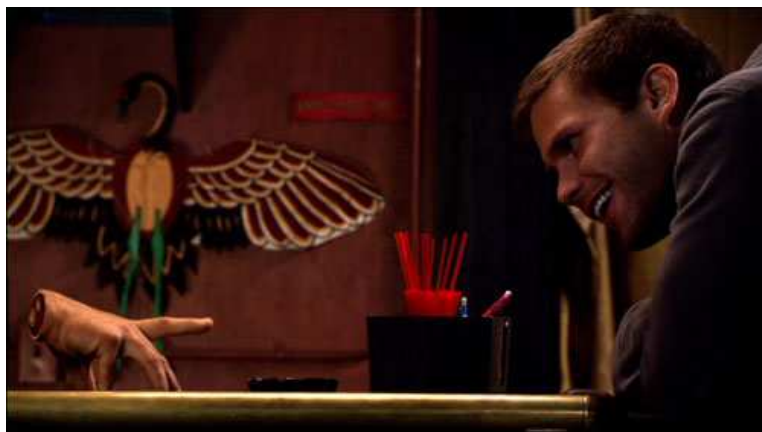
That's easy for you to say!