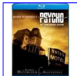
Psycho (50th Anniversary Edition) Blu-ray

The Psycho Legacy follows the indelible filmmaking legacy left by the Psycho movies and unravels the screenwriting, casting and directing of all the movies, examining their undeniable longevity and success. Interweaving ultra-rare and never-before-seen interview footage of Anthony Perkins and dozens of interviews including Robert Loggia, Olivia Hussey, Henry Thomas, Diana Scarwid, Tom Holland, Hilton Green, Mick Garris and many more, The Psycho Legacy is the first documentary to unite and explore decades of Psycho movies in one place, revealing surprises and insights into what is considered the grandfather of modern horror.