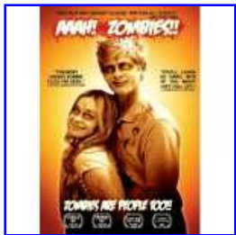
Aaah! Zombies!! (2007)

Tony Washington foils a robbery at a local grocery store only to be run over and killed by a group of savage suburban teens. But the horror has only just begun, for in the darkest recesses of Tony's backyard, a voodoo ceremony takes place which resurrects Tony into a superhuman zombie avenger. One by one, Tony's ruthless killers are graphically and brutally murdered as the undead Tony takes his gory revenge! The stage is set for a bone-chilling climax as the authorities finally come face to face with the dead rising from the grave. The film stars Adam West, Tia Carrere, Jon Mikl Thor, and John Fasano.