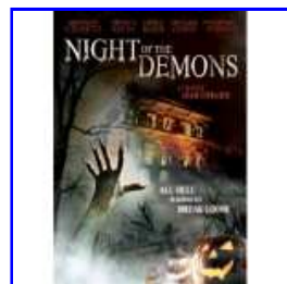
Night of the Demon

Check out our coverage of Predators in Famous Monsters #251