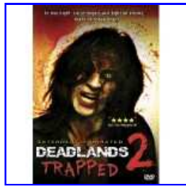
Deadlands 2: Trapped (Extended & Unrated)