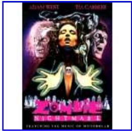
Zombie Nightmare (1986)