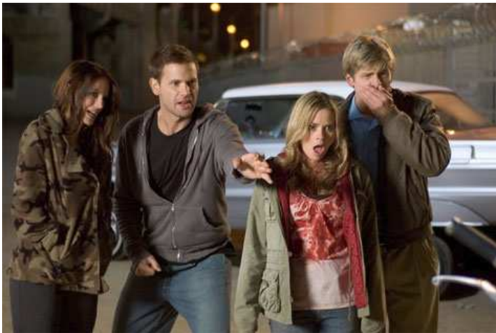
Just four living impaired friends having a night on the town.

For more information on this Zombie Comedy check out the Aaah! Zombies!! Facebook page . As well as the Leverl 33 Entertainment webpage .