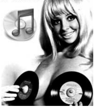
JOIN US ON FACEBOOK!

The Movies about Girls Podcast. Hours of laffs. Special guests. Groovy. Click her(e) to subscribe on I-Tunes.