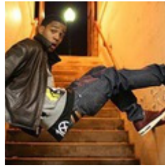
Top 10 The Softest Rappers In The Game