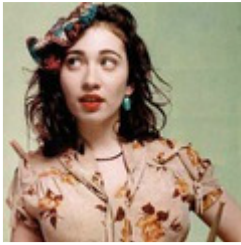
10 Jewish Musicians That Rock!