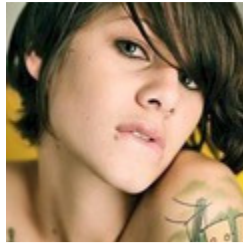
Most Controversial Music Videos Ever