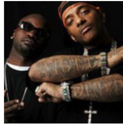
20 Of Rap's Most Memorable Opening Lines