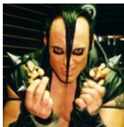
The Worst Lead Singer Replacements