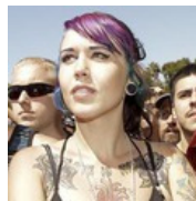
Amazing Pics of Rock Metal Chicks