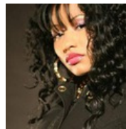
The Tragedy Of Nicki Minaj!