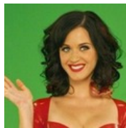
Five Songs Written By Katy Perry And Recorded By Someone Else