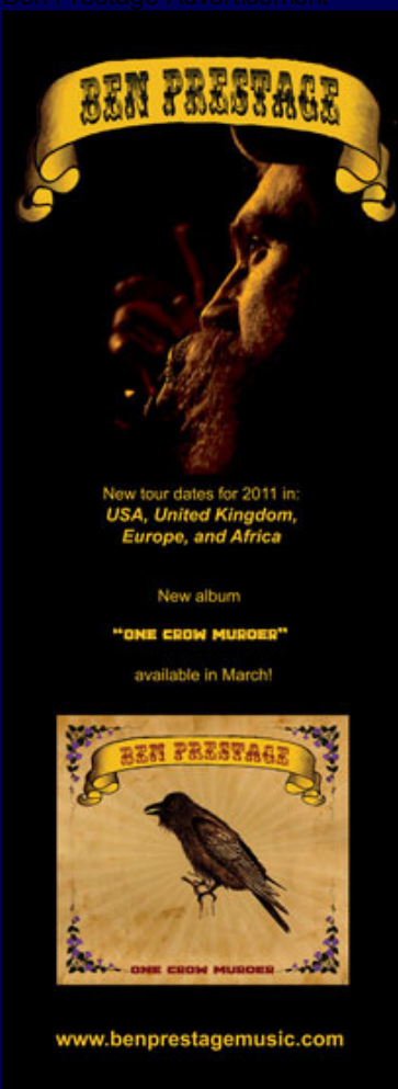
o Waterfront Blues Festival Advertisement