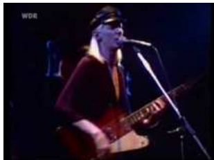
Video: Johnny Winter: Live At Rockpalast 1979

Rating for Johnny Winter: Live At Rockpalast 1979: