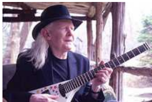
A Guitar God...