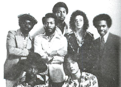
Cold Bold Group, ca. 1974 (T Gable Archive)