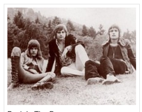
Back In The Day...