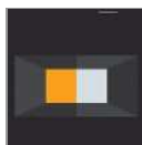
Pharaoh Overlord Lunar Jetman