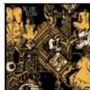
The Love Below Every Tongue Shall Caress