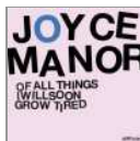
Joyce Manor Of All Things I Will Soon Grow Tired