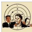
Graf Orlock Los Angeles