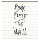
Pink Floyd The Wall (Experience Edition)