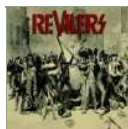
Revilers Self Titled