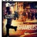
Shambles Self Titled