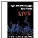
Iggy & The Stooges Raw Power: Live In The Hands Of The Fans