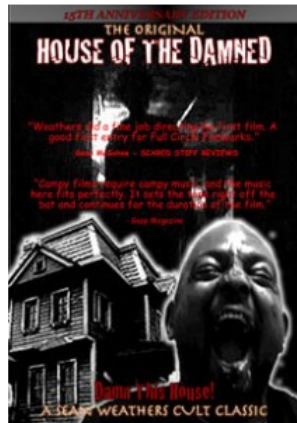
“House of the Damned”

AMOS ♦ SEPTEMBER 2, 2011 ♦ LEAVE YOUR COMMENT