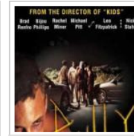
Film Review: Bully (2001)