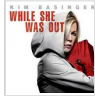
Film Review: While She was Out (2008)