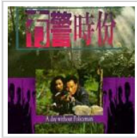
Film Review: A Day Without Policemen (Mou jing shi fen) (1993) - CAT III