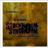
Film Review: Stockholm Syndrome (2008)