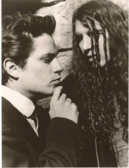
FLAT DUO JETS