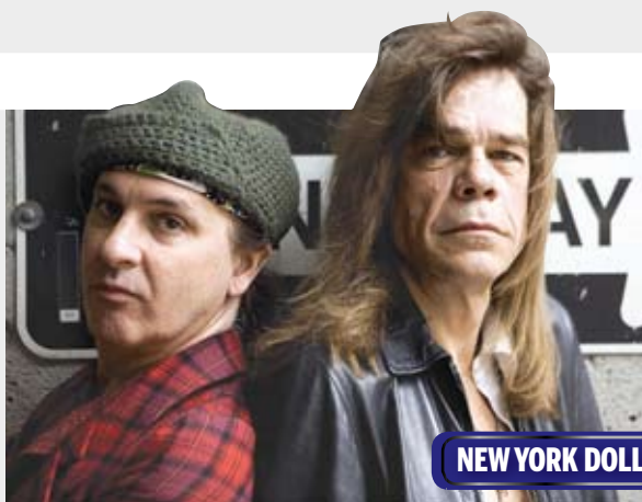
NEW YORK DOLLS