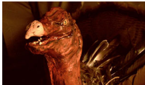
"Gobble Gobble, Motherfucker"

But wait, there is more. How about the puns that weld the ability to kill more brain cells than slamming your head against the wall, repeatedly? I'll give it to them, that some of them are just plain 'punny', but a lot of them are just plain weak. And to top it all off, they fuse the puns with delicious sexual innuendos. Because why isn't it funny when you here a turkey yell "You got stuffed" after having intercourse with a girl? Stay classy, turkey.