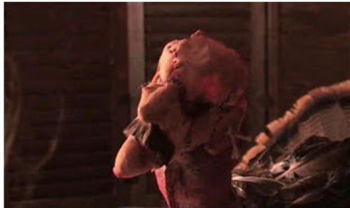
Warning: Some turkeys know how to use face masks to fool humans.

A few of the more tolerable moments in this movie all have one crucial character to do with it, the killer turkey. His terribly awesome puns and ironic way of disembowelling his victims brings a lot of chuckles my way. Especially his one-liners, not as good as Arnies, but still carry a punch peck. One of his better lines are "Gobble Gobble Motherfucker!" Classy, yet sophisticated in a flightless kind of way. Sadly he might have been the only good character in the whole movie, the rest of the cast are filled with hungry college kids doing anything for a few brews and a food stamp.