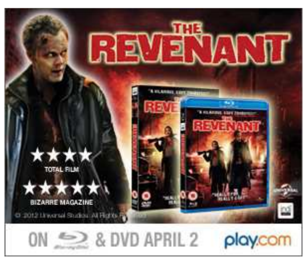
The Ultimate Movie Podcast