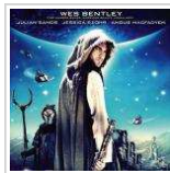
Film Review - Hirokin: The Last Samurai