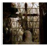
Film Review: Dellamorte Dellamore