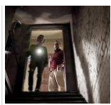
Film News: Day of Horror at the 18th Bradford International Film Festival With "Bradford After Dark"

We have updated our Privacy and Cookie Policy in line with the new EU privacy regulations.