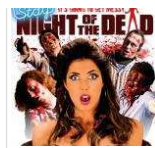
Review: Stag Night of the Dead (Updated Review)