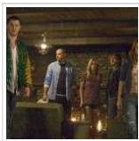
Film Review: The Cabin in the Woods - No Spoilers Just Quite a Bant