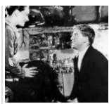
Film Review: Miracle in Milan