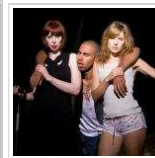
Short Film Review: Hit Girls