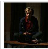
Film News: 20th-22nd April Bradford After Dark (The Innkeepers, Juan of the Dead, Livid & more) AN...

We have updated our Privacy and Cookie Policy in line with the new EU privacy regulations.