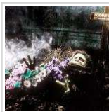
Festival Report: BIFF - Bradford After Dark - The Plague of the Zombies