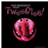
Tweedles Audio CD