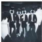
Eskimo Audio CD