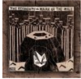
Mark Of The Mole/Intermission Audio Double CD