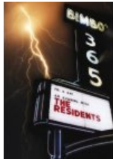
Talking Light: Bimbo's DVD