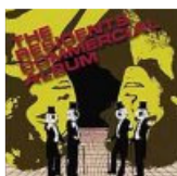
The Commercial Album Audio CD