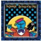
The Tunes Of Two Cities/The Big Bubble Audio Double CD