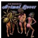
Animal Lover Audio Double CD