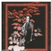
Third Reich 'n' Roll Audio CD