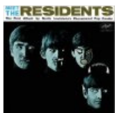
Meet The Residents Audio CD

part venture but only actually managed four, Mark Of The Mole ('81), The Tunes Of Two Cities ('82), Intermission ('83) and The Big Bubble ('85). This decade also saw the creation of God in Three Persons ('88), a story about the exploitation of siamese twins and The King & Eye ('89), a biography of Elvis Presley. More recently Animal Lover was released in 2005 and Tweedles in 2006 ( it should be noted however that this only touches on the wealth of material that is out there, their album releases alone currently number over 60 ).