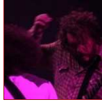
Don't Follow Me (I'm Lost): Bare on th...