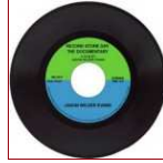
5+1, Record Store Day Edition: Hot Wax 2