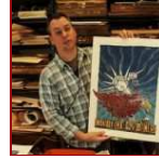
Just Like Being There: Framing the Art of the Gig ...