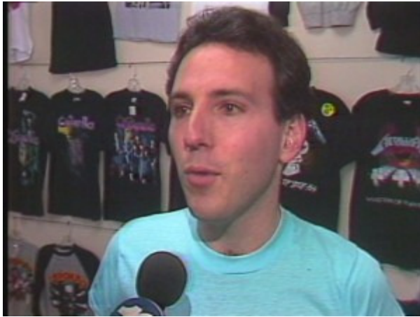
Rock 'N' Roll Comics founder Todd Loren

gory images of horror and very explicit sexual content. The fact that Loren's comicbooks also pissed off the artists for sometimes painting very unflattering pictures of them (such as the New Kids on the Block issue, or even the Guns N' Roses one) evident by the various lawsuits made the comics even more rebellious.