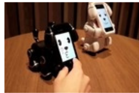
The Creators Project iPhone-Faced Robot Dogs!