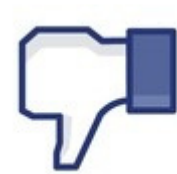
Motherboard Keep Your Facebook Enemies Closer