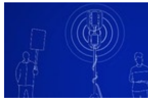
Motherboard Free the Network