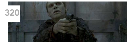
320 [BD Caption Contest] Give Bub A Hand!!!