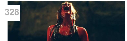
328 [BD Caption Contest] The Cave Dwelling Edition!

LEAVE A COMMENT | You must be logged in to post a comment.