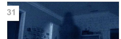
31 Finally! The Full Trailer For 'Paranormal Activity 4'!!!