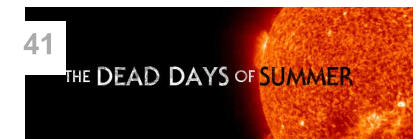
41 [Dead Days Of Summer] Day 3: Comment To Win One Of EIGHT Incredible 'Metro: Last Light' Gas Masks!