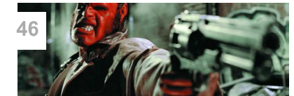
46 What Comics Do You Want Adapted For The Big Screen?