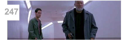
247 [BD Caption Contest] Win 'Jaws' On Blu-ray!!!