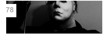
78 If You Could Remake 'Halloween' Or 'Hellraiser', What Would You Do?