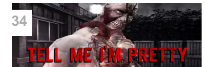
34 [Giveaway] Comment To Win The 'Resident Evil: Chronicles HD Collection'