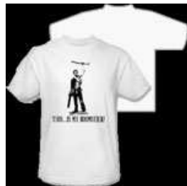
Army of Darkness Boomstick White Shirt