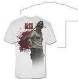
The Walking Dead Dot Splatter Shirt