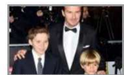
Hot Celeb Dad: David Beckham

Flickr Error: Invalid API Key (Key has expired)