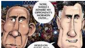
Presidential debate: Will Romney make the ultimate flip-flop?