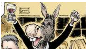
Barack Obama takes command in second presidential debate

October 18, 2012 | 10:39 p.m.