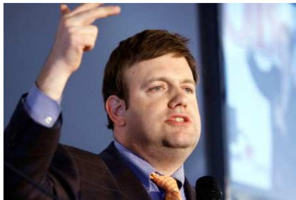
Frank Luntz

The official pollster of Fox News, Frank Luntz, is the man who renamed the estate tax the “death tax” and told Republicans to lie and call healthcare reform a “government takeover” of the medical system. It turns out he’s also the guy who tested anti-Obama films, including one that features photoshopped “nude” photos of President Obama’s mother and depicts her as possibly a prostitute, for a shadowy GOP donor. Now DVDs of the scurrilous film, “Dreams from My Real Father,” are finding their way into mailboxes in swing states.