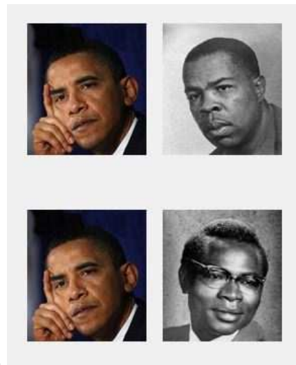
President Barack Obama's real father is not Barack Obama Sr. (bottom right), but the late communist journalist Frank Marshall Davis (upper right), according to a wild new film.

In Dreams from My Real Father, Barack Obama is portrayed by a voiceover actor who chronicles Barack Obama's life journey in socialism, from birth through his election to the Presidency. The film begins by presenting the case that Barack Obama's real father was Frank Marshall Davis, a Communist Party USA propagandist who likely shaped Obama's world view during his formative years. Barack Obama sold himself to America as the multi-cultural ideal, a man who stood above politics. Was the goat herding Kenyan father only a fairy tale to obscure a Marxist agenda, irreconcilable with American values?