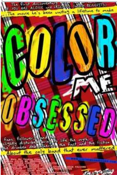
Color Me Obsessed: A Film About The Replacements