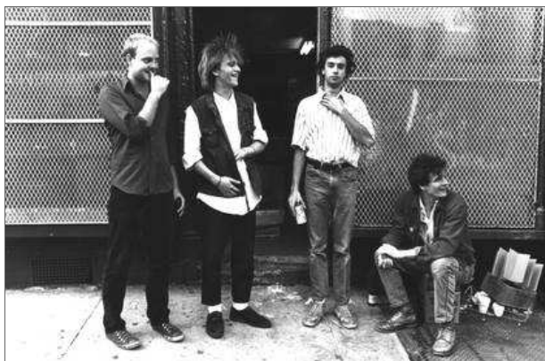
CAPTION Twin Tone Records

If there's one band that absolutely deserves the documentary treatment, it's The Replacements .