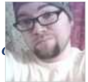
Chuck Conry Chucks website