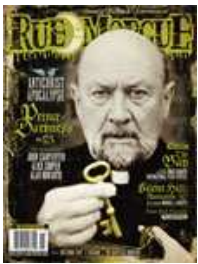
Rue Morgue Magazine - Issue #128 December 2012