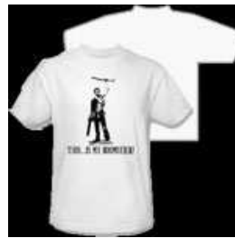
Army of Darkness Boomstick White Shirt