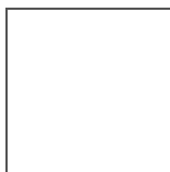
Horror Film BATH SALT ZOMBIES Premiering In Philadelphia On ...