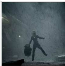
Sigourney Weaver Talks Prometheus