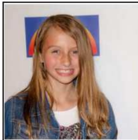
'Rock Jocks' Los Angeles Screening Pictures