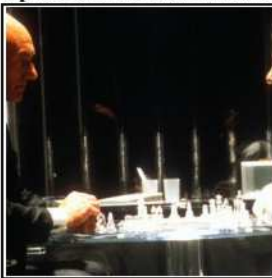
Heavyweights to Return for new X-Men?