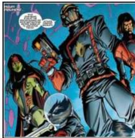
Guardians Of The Galaxy Has A Release Date!