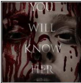
New Carrie Images Are Scourged with Scorpions!