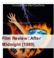
Film Review: After Midnight (1989)