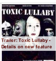
Trailer: Toxic Lullaby - Details on new feature