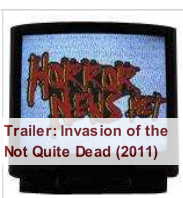
Trailer: Invasion of the Not Quite Dead (2011)