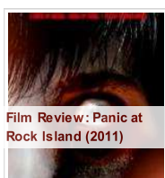
Film Review: Panic at Rock Island (2011)