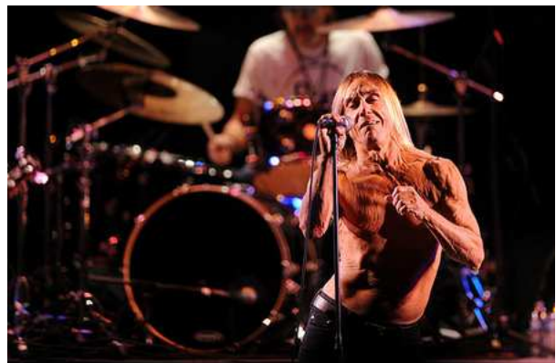
Iggy and the Stooges play at the Michigan Theater in 2011.

I Got a Right (with Henry Rollins) Raw Power