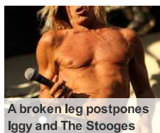
A broken leg postpones Iggy and The Stooges