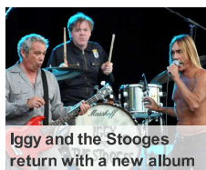
Iggy and the Stooges return with a new album