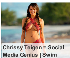
Chrissy Teigen = Social Media Genius | Swim