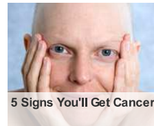
5 Signs You'll Get Cancer