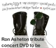
Ron Asheton tribute concert DVD to be