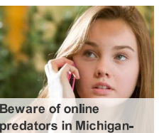
Beware of online predators in Michigan-