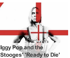
Iggy Pop and the Stooges' 'Ready to Die'