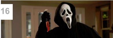
Writers Announced For MTV's 'Scream' Series