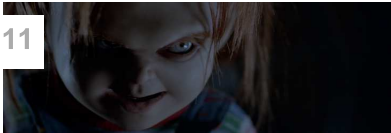
Exclusive: 'Curse of Chucky' Red Band Trailer Will Slice You Into Silence!