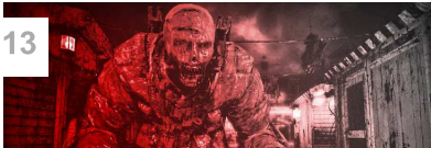
6 Horror Games We Want On Next Gen Consoles!