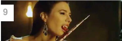
The 'Fright Night 2' Trailer Has Leaked!