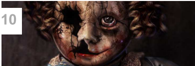
Early Concepts For 'The Conjuring's' Creepy Annabelle Doll!