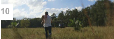
[TIFF '13 Spotlight] Ti West's 'The Sacrament' To Become "Cult" Classic?