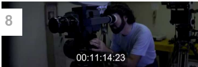
[OMFG] Footage From 'Unseen Halloween' and Then Demand Its Release!