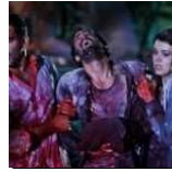
Movie Review: Aftershock (2013)