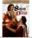
DVD Review: Samson and Delilah (1949)