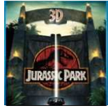
Blu-ray 3D Review: Jurassic Park