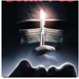
DVD Review: Stripped