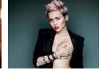
Miley's Raunchiest Photos Ever