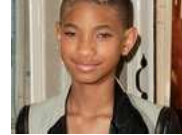
Willow Smith Finally Starts Dressing Her Age