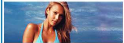
Getting By On Looks Alone