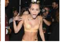
Miley Cyrus Admits She's Had A 'Messed Up' Life