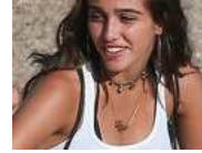
Madonna's Daughter Blossoms Into A Beauty