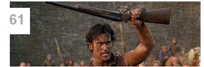
As We Suspected, 'Evil Dead' Is A Sequel That Eventually Leads To Major Crossover In 'Evil Dead 7'!!