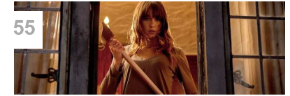
The 'You're Next' Trailer Is Here! And It's Worth The Wait!!!