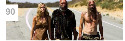
The 5 Rob Zombie Films From Worst To Best!!!