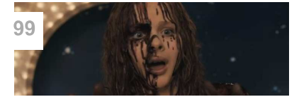
Mama, Prom, Blood And Telekinesis Fill Out The Full 'Carrie' Trailer!!! Plus Over 2 Dozen High-Res Images!