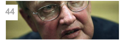
[R.I.P.] Roger Ebert (1942-2013)