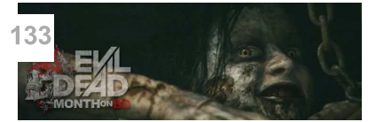
[Reader Review] Scorpionsy Compares the New 'Evil Dead' With the Original

LEAVE A COMMENT | You must be logged in to post a comment.