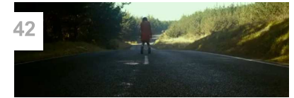
Spoilers!!! About That Alternate Ending For The 'Evil Dead'!