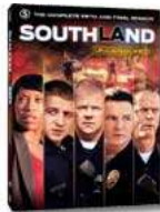
Southland The Complete 5th & Final Season