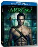
Arrow The Complete 1st Season Blu-ray