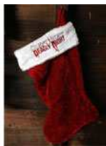
Silent Night Deadly Night Santa Stocking