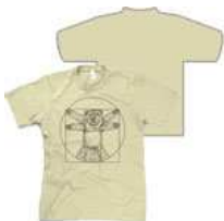
Star Wars DaVinci Ewok Shirt