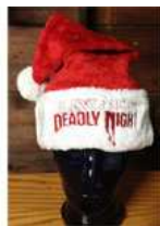
Silent Night Deadly Night Santa Hat