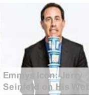
Emmys Icon: Jerry Seinfeld on His Web Series