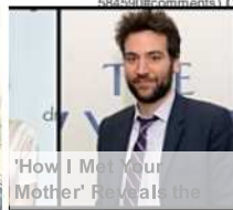
'How I Met Your Mother' Reveals the Secret to Success