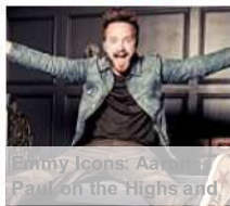
Emmy Icons: Aaron Paul on the Highs and Lows of Breaking Bad

by Taboola (www.taboola.com/popup?template=colorbox&utm_source=the&utm_medium=taboola&utm_content=short&utm_campaign=ent&utm_term=) under fire