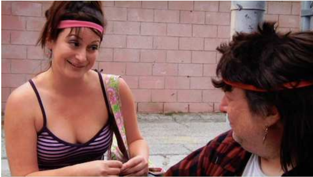
It's the 80's. You can tell because: headbands.

Is that bad? No, not at all. C&ODX is really good at what it is: a really silly, campy, self-referentially bad movie that knows how bad it is. And is it bad? Again, no, because it plays on the fact that it knows it's bad. It knows that a flashback or dream sequence is a cheap scriptwriting device, and comments on it on most of the many dreams/flashbacks presented. It is this sort of very meta humor that makes C&ODX so good. It is cheesy, yes, but in a good way, and when you have good cheese you get camp, and that's a whole different sport.