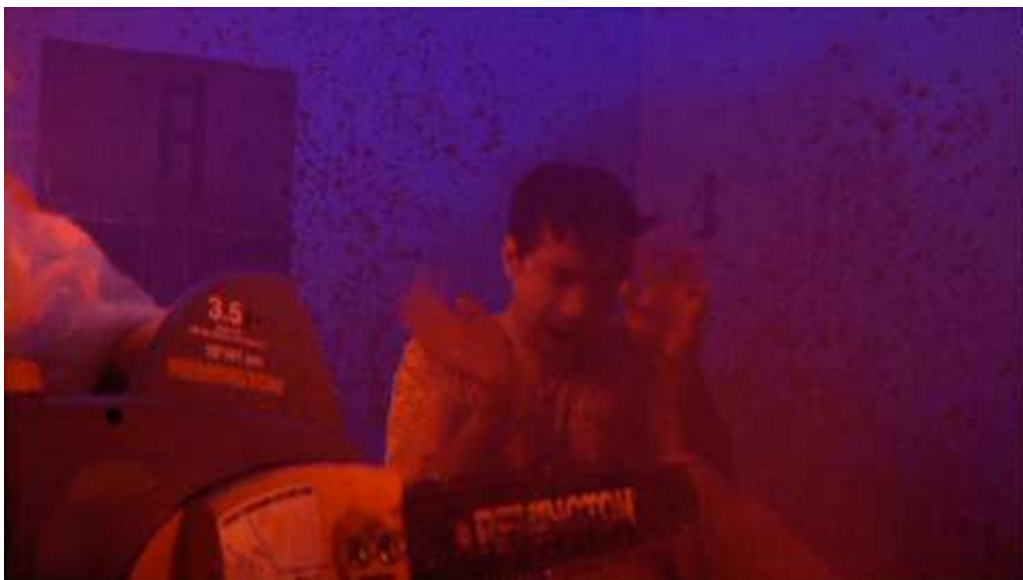
Not my posters!