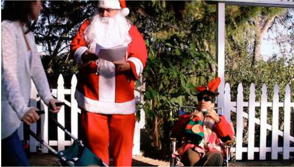
Santa and his gay reindeer.

What I really enjoyed about C&ODX is the fact that it does not ever, ever take its self seriously. This is a bad movie that revels in its badness, this is a movie that really knows how bad it is but puts it in your face and says "Look at me!" I can get into that esthetic. C&ODX is a very much like a Troma film (blood and nudity [though just a tiny bit] and weird situations with a weird killer) but like the best Troma films (those of Lloyd Kaufman himself), it does not take itself seriously. It never really tries to scare you, it never puts up pretense that C&ODX is a art film or a important film or a serious film. C&ODX is here to get drunk on Christmas egg nog and have a few laughs at its own expense, like that Uncle everyone says they don't like yet they keep inviting to all the family gatherings because he's just so damn fun to be around.