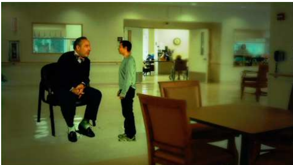
Never listen to your family's stories if your family is Lloyd Kaufman.

Caesar is an effeminate, possibly gay (but probably not) struggling actor. Otto is his bumbling half brother (who looks almost old enough to be his Dad, or at least an Uncle). Together they make up a great comedy duo, along the lines of Jay and Silent Bob. Except neither of them really shut up. Caesar has had a fear of Santa ever since his family – in a horribly mean prank – told him the story of a Santa that cuts off penises with a chainsaw. Then there was a Santa with a chainsaw. I think for most of us that would have deep, long-lasing emotional scars, and Caesar is no different. He and Otto decide to get involved with Xmas International, a company that does, well, Christmasy stuff. And from there it goes downhill.