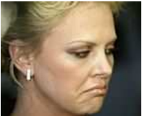
7 Famous People Who Hit Bottom - and Turned it Around Life Reimagined