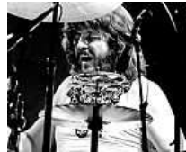
Flashback: Led Zeppelin's Final Concert With John Bonham Rolling Stone