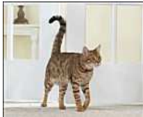
The tales the cat tail tells Hill's Pet