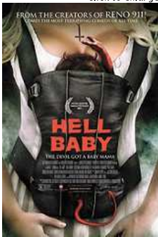
Hell Baby (R) Millennium