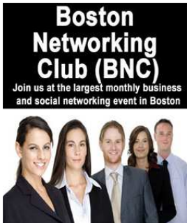
BNC Cocktail Party 3/26