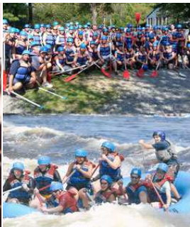
$99 White Water Rafting