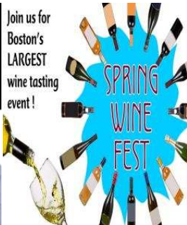
Spring Wine Fest 3/22