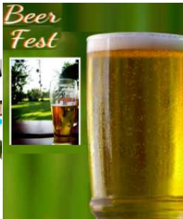
Spring Beer Fest 3/23