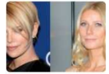
When Celebrities Make Controversial Statements: Gwyneth Paltrow Vs. Charlize Theron