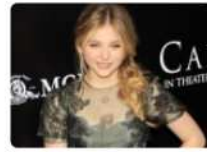
Chloe Grace Moretz Sums Up Hollywood Life So Perfectly, You'll Forget She's Only 17