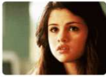
Selena Gomez Has Chosen Suki Waterhouse And Cara Delevingne As Her Instagram Besties This Week