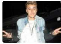
Justin Bieber Was Allegedly Caught Using Racial Slurs, Is Maybe On A Quest To Become The Worst Person Ever