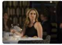
Lifetime Movie The Secret Sex Life Of A Single Mom Should Have Stayed A Secret